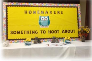
In Memory Of